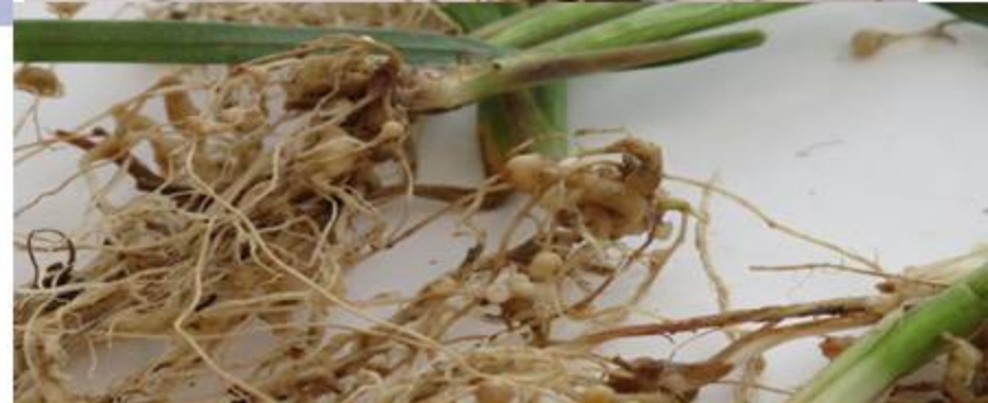
Root-knot Nematode, Meloidogyne graminicola Golden & Birchfield)