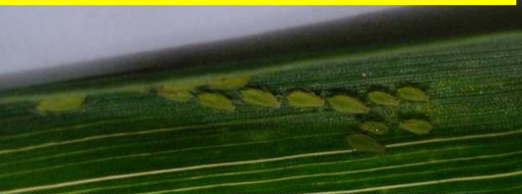
Wheat aphid, Rhopalosiphum maidis Fitch