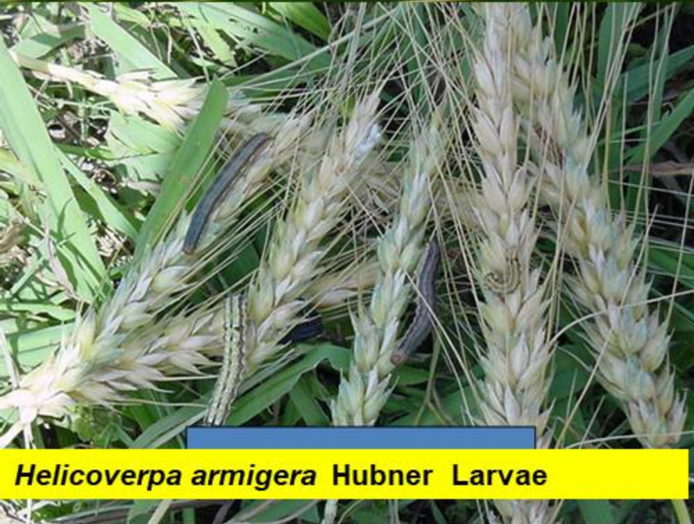
Helicoverpa armigera Hubner Larvae