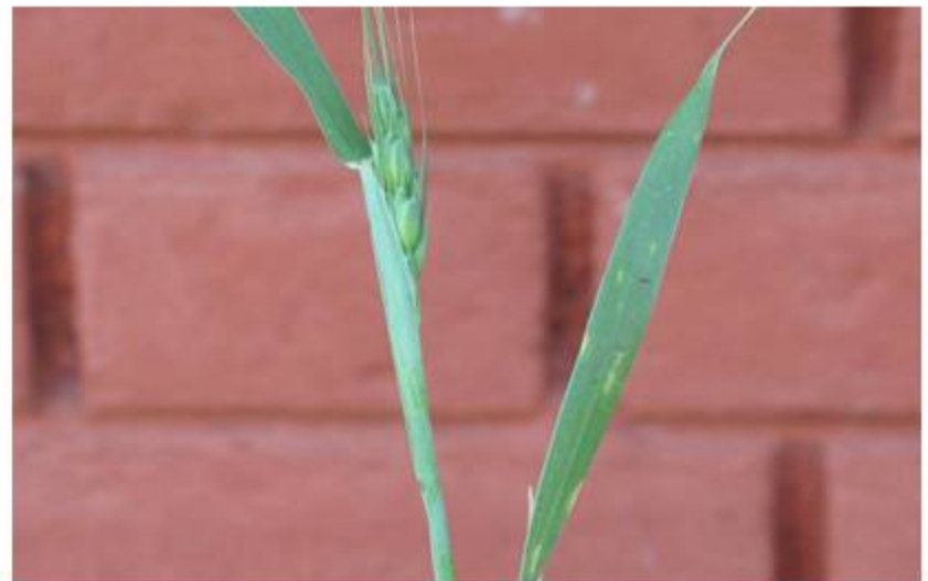
HPW 314 (Resistant)