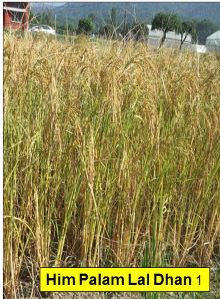
Him Palam Lal Dhan 1